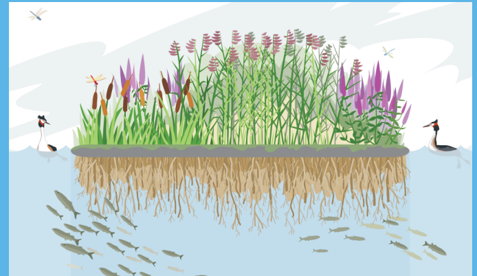
Scheme of a floating macrophyte island

The other island is made of a stainless steel mesh which is filled with dry reed stems and hollow stainless steel buoys to enhance the buoyancy effect. Macrophytes such as the beautiful flowering Purple loosestrife and Yellow flag, but also Lesser pond-sedges and Lakeshore bulrush were pre-grown on coconut coir fibers mats and were laid on the floating matrixes.